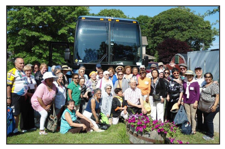
Encore seniors head home after a fun-filled day at Pindar Vineyards on Long Island.

The seniors pictured here were delighted to take a bus trip to Pindar Vineyards on the North Fork of Long Island on June 26, a popular destination for many New Yorkers. Encompassing more than 500 scenic acres, Pindar Vineyards offers magnificent vistas and informative lectures on winemaking. Afterwards, seniors headed over to a local restaurant offering waterfront dining, where they enjoyed a delicious luncheon while relishing the lovely water views of Long Island Sound. Our seniors agreed the day offered a welcome reprieve from the crowded streets of the city.